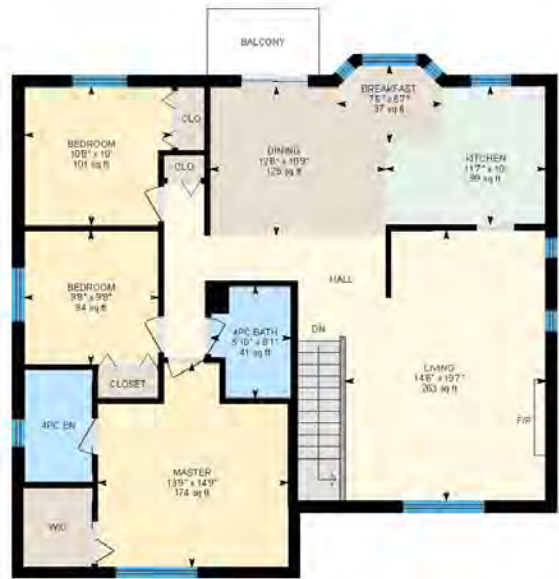
2nd Floor Exterior Area 1354 sq ft