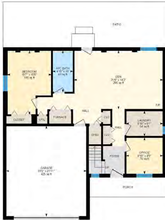
Main Floor Exterior Area 1001 sq ft

Main Building: Total Exterior Area Above Grade 2355 sq ft