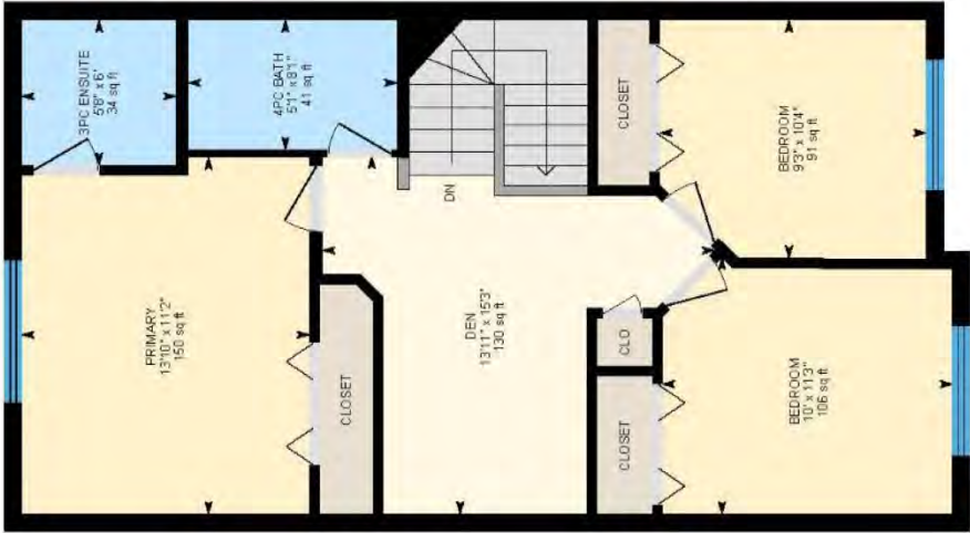
3rd Floor Exterior Area 758.78 sq ft