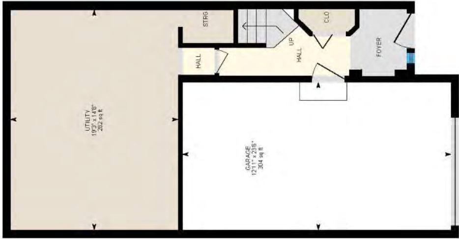
1st Floor Exterior Area 466.32 sq ft

Main Building: Total Exterior Area Above Grade 1970.06 sq ft