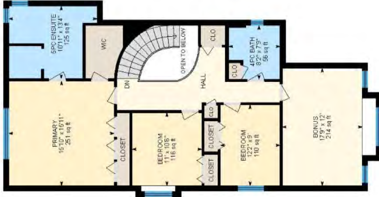
2nd Floor Exterior Area 1344.26 sq ft