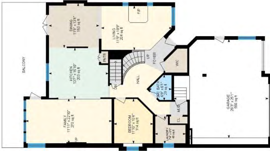
Main Floor Exterior Area 1481.02 sq ft

Main Building: Total Exterior Area Above Grade 2825.27 sq ft